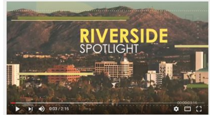
Arts Spotlight: Creativity is EVERYWHERE at Encore High School Riverside